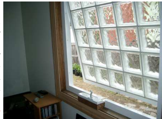
The latest innovation: entire windows that open exclusive to Absolute Brilliance Glass Bricks